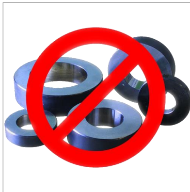
No need to have a lot of different setting rings.