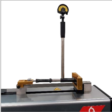
Setting of two-point bore gauges