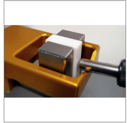
Ceramic gauges block