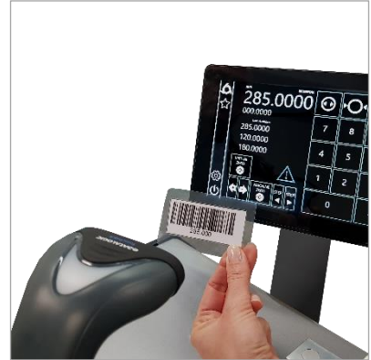
Datalogic Bar-code device to speed up the input of setting values